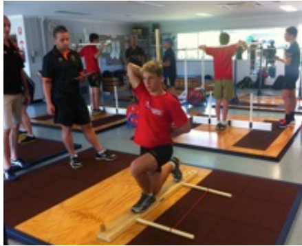
Functional movement screening